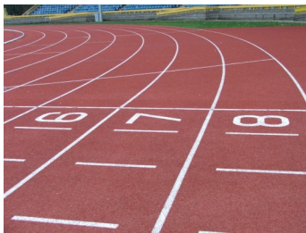
St. Ambrose Track Team